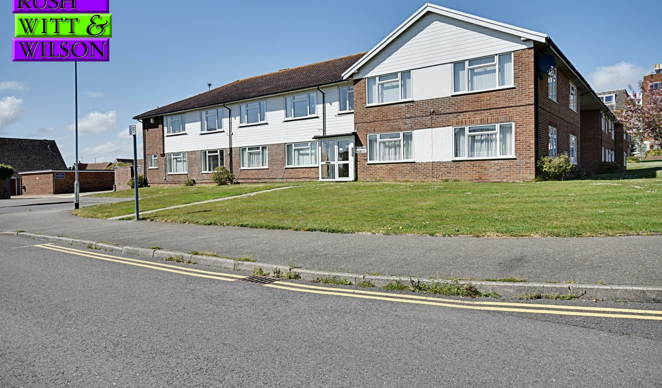
9 Normandale House Normandale, Bexhill-On-Sea, East Sussex TN39 3NZ £250,000